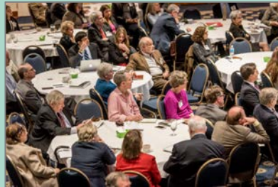
Exhibit Sponsor - Lead ($1,500)